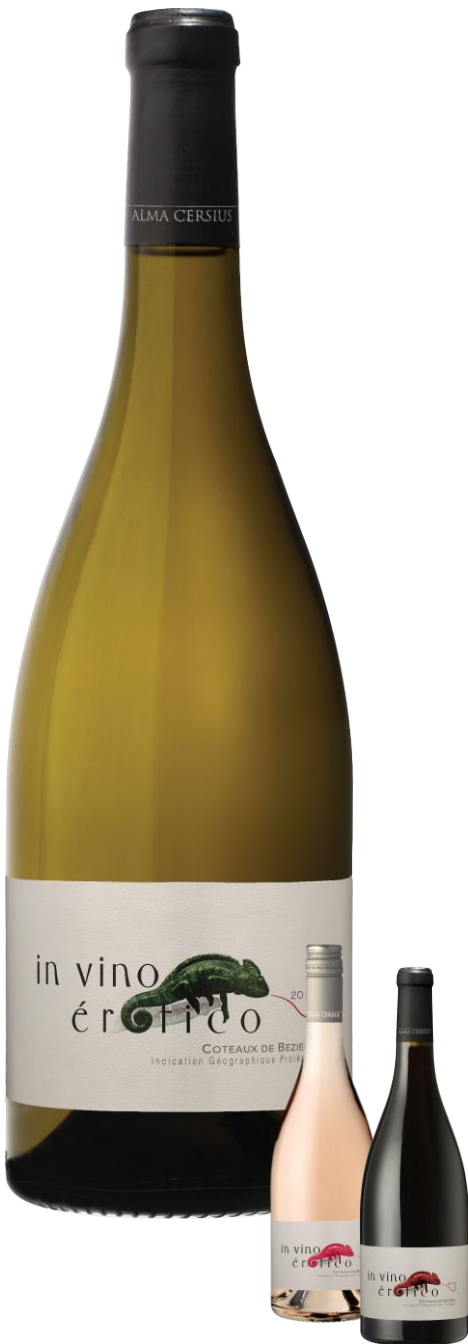
Non contractual pictures