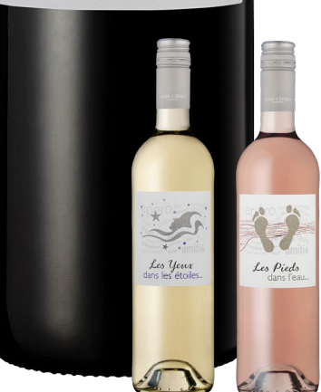
Non contractual picture