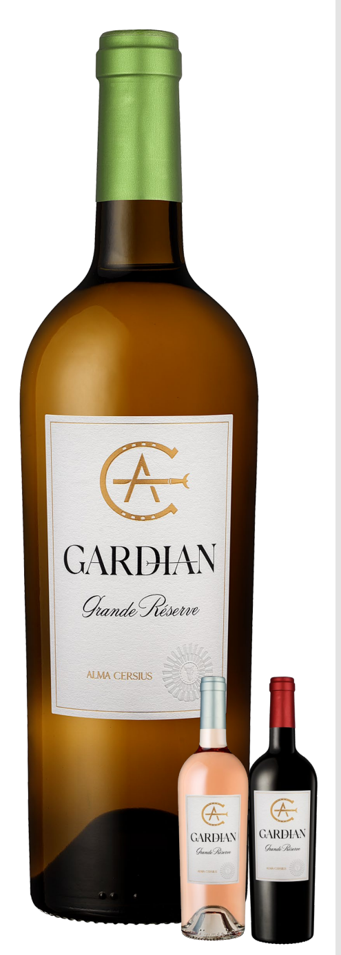
Non contractual picture