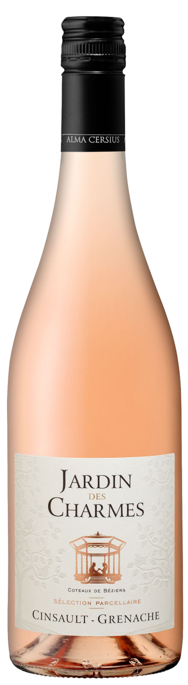
Non contractual picture