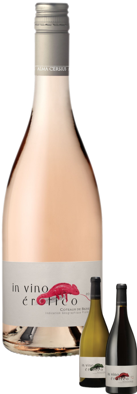
Non contractual pictures