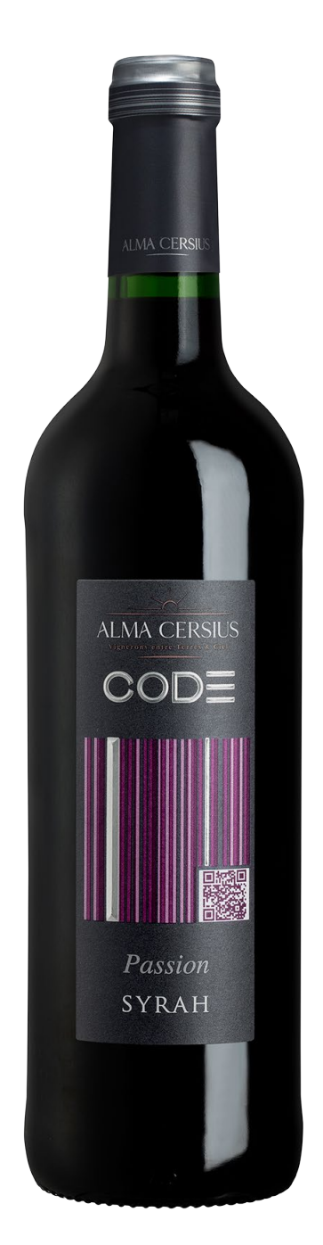
Non contractual pictures