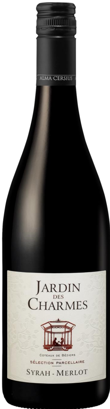
Non contractual picture