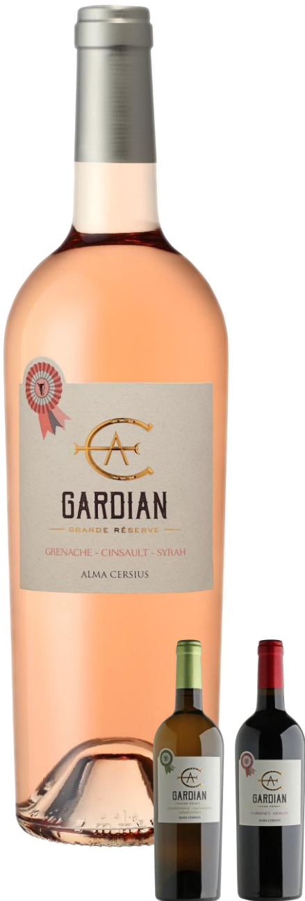
Non contractual picture