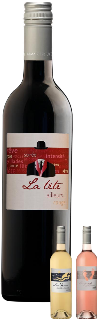
Non contractual picture