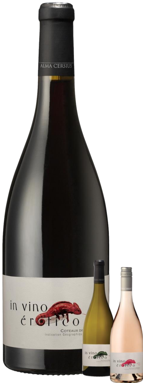
Non contractual pictures