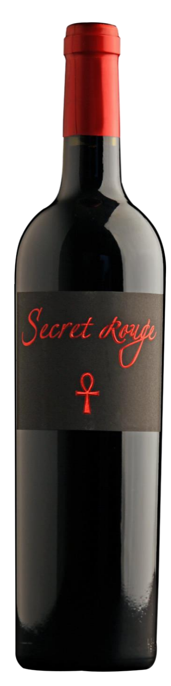
Non contractual picture