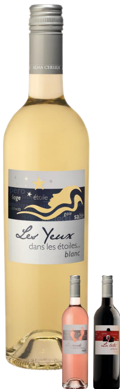
Non contractual picture